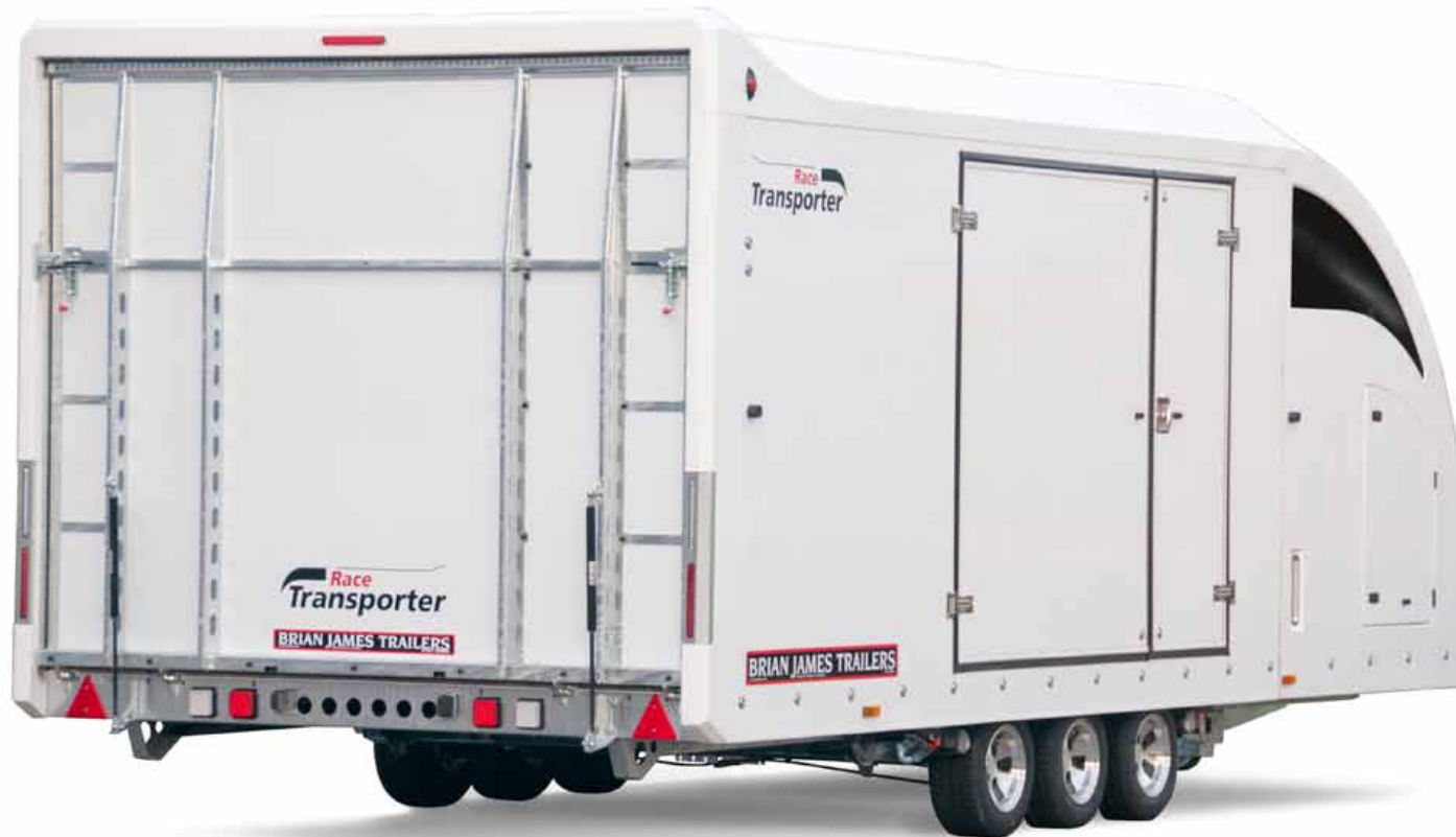
Race Transporter 6

With much standard equipment provided to cover vehicle transportation requirements, attention has been focused on creating working facilities for private racers and teams alike. Various additional storage bins, lockers and racks take advantage of available spaces. An integrated interior LED lighting option provides many hours of lighting from the on-board battery. A workbench combined with a tyre rack or an individual tyre rack also feature as highly useful additions. Please refer to later pages for further information on the full range of options.